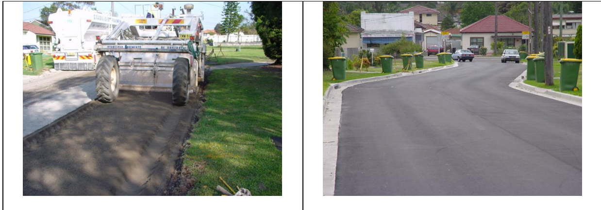
Figure 1 Insitu stabilisation is a simple process of mixing the existing pavement material with a binder (left) and then compacting and resurfacing the road.