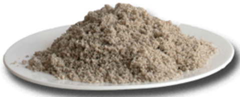
Figure 1 – Granulated Iron Blast Furnace Slag