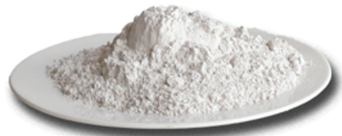
Figure 2 – Ground Granulated Blast Furnace Slag