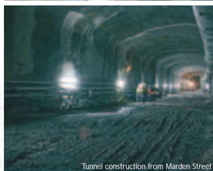
Tunnel construction from Marden Street