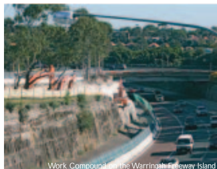
Work Compound on the Warringah Freeway Island

previously led to the use of concrete with a characteristic strength far higher than the design strength. So, a different approach was taken. Concrete was trialed incorporating milled slag for added durability. The benefits to the client are clear: concrete with improved durability performance, at a cost saving, and an opportunity to learn for future projects. The use of slag for the benefit of client and supplier is typical of the collaborative approach being taken by Readymix on key projects. C