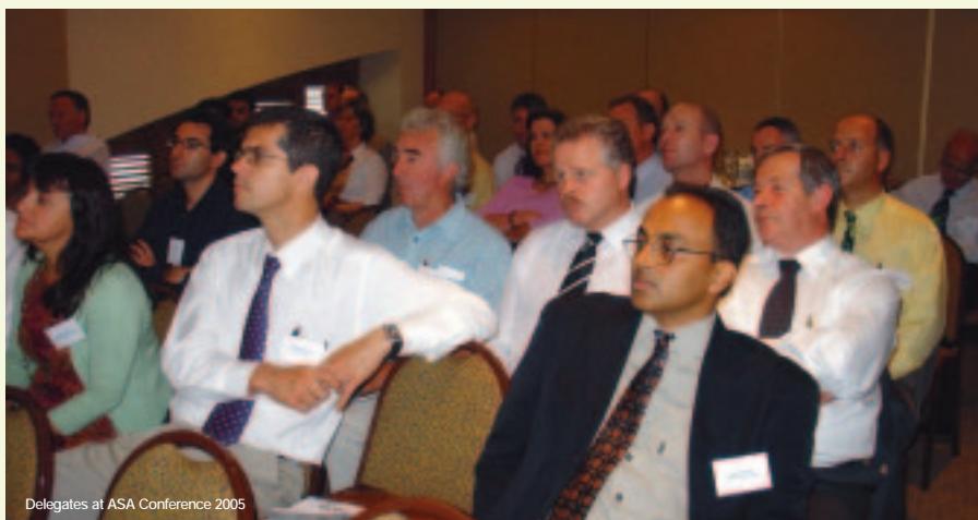
Delegates at ASA Conference 2005

The opportunity to save 17.03 tonne of greenhouse gas, or equivalent to emissions from a four-cylinder car for 5.66 years in constructing a residential dwelling was highlighted. Research covering environmental assessment of slag enables it to be classified as inert under the NSW Waste Classification Guidelines. Experience with the use of slag products for waste water treatment points the way for more innovative uses. The HEWSO (2004) cross discipline student group from the University of Wollongong brought quite a