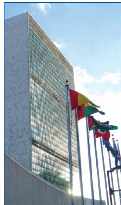
European Parliament Building

Negotiations are underway between Australasian (iron & steel) Slag Association and the Global Slag Conference organisers to bring a conference event to Sydney in 2010. Watch future issues of Connections for advanced notice and details.