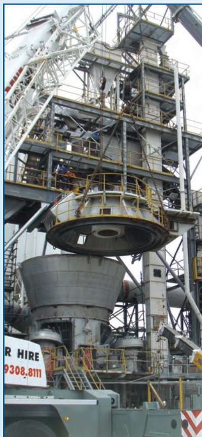
Removal of old separator

The upgrade was completed in early February this year with the Mill back on line after 5 weeks of intense construction & overhaul. Melbourne had recorded its highest ever temperature of 46.7 degrees celsius after a record number of days in excess of 40 degrees celsius, so day shifts were cancelled in lieu of working at night. Further challenges to the project were encountered with the simultaneous realignment of the wharf adjacent to the Mill. The $25m project is part of the channel deepening project undertaken by the Port of Melbourne Corporation. All expectations were met on the project with current outputs in excess of 37T/hr. The $1.5M separator upgrade will help Steel Cement meet the growing demand for ground slag.