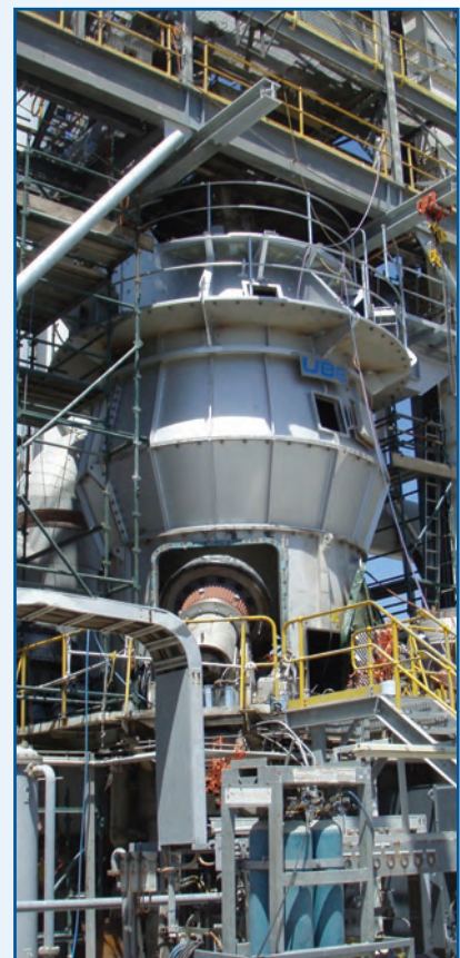
New separator and upper casing installed