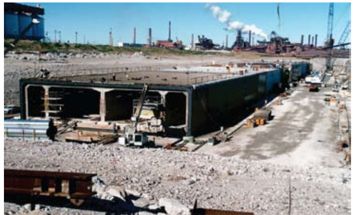
Immersed Tube sections Sydney Harbour Tunnel – Port Kembla

Arising from the forum, five issues were identified that could enable more effective concrete research and industry operations, they are; (1) Sustainability; (2) Durability and Longevity; (3) Innovation; (4) Knowledge Transfer Mechanisms; and (5) Communication. In particular, SCM's received specific attention from the academia, industry, government and construction sectors about current and future supply capacity.