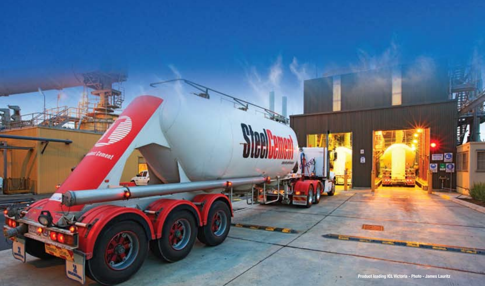
Product loading ICL Victoria