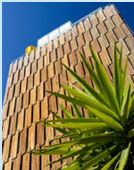
Melbourne City Council - Council House 2 (CH2)