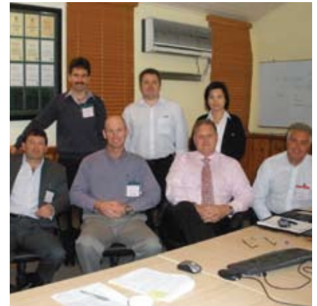
ASA committee members meeting in Brisbane.

The role of the Education Committee is to plan and implement communications and education strategies. Output from this committee includes Technical Sheets, Connections Newsletter, the ASA Website and oversight of the Conferences and presentations that make the knowledge base of the Association available to students and practitioners alike. The online reference library is accessible by logging onto www.asa-inc.org.au . Members of the results from completed research form part of future conference and education programs.