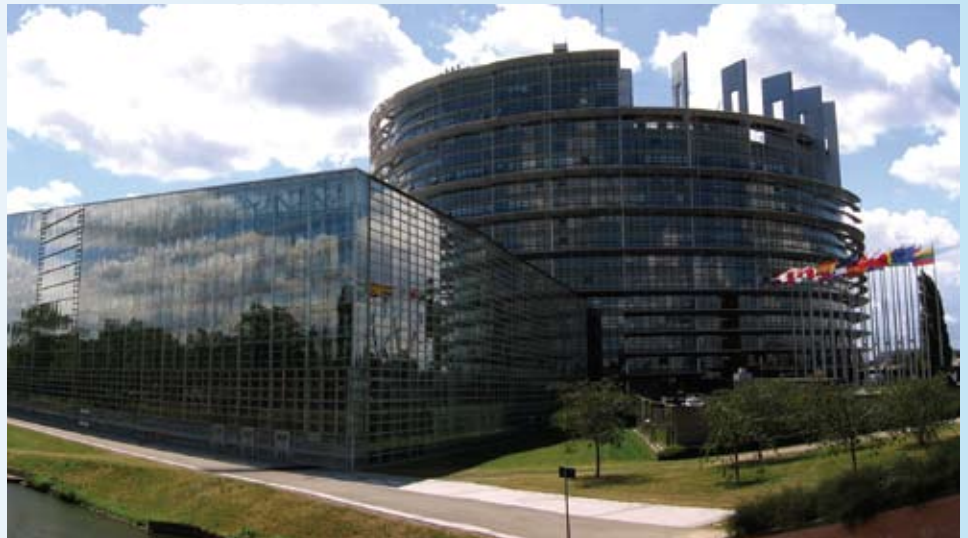
EU Congress Building

The conference farewell reception will take place at EU Congress, where we have been granted access to one of the function rooms. There will also be an hour long tour of the Congress building.