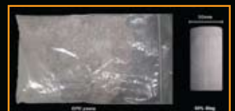
After 1 Year OPC Paste and 50% Slag