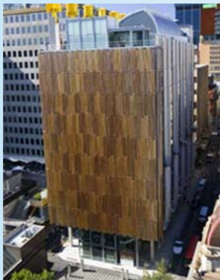
Melbourne City Council - Council House 2 (CH2)