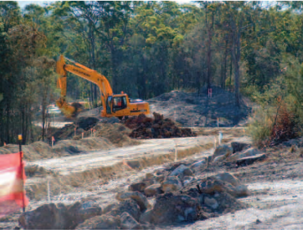
Approximately 60,000 m<sup>2</sup> of fill is to be hauled across the Pacific Highway under traffic control with minimal disruption to both the local residents and the traveling public.

N OCTOBER 2003 SEYMOUR WHYTE CONSTRUCTIONS won the tender for the design and construction of the Wallarah Peninsula Interchange, the first stage of the 10 year development of the Wallarah Peninsula by Lensworth. The project involves the construction of an underpass bridge across the Pacific Highway, on and off ramps, drainage, pavements, lighting and associated works for the interchange.