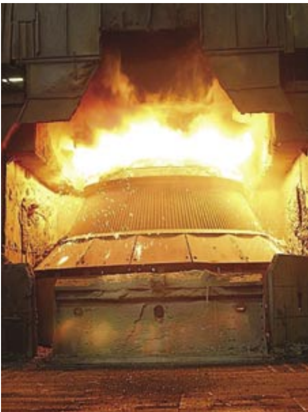
Figure 1 Basic Oxygen Steel Making Vessel

The lime in the charge melts and fluxes silicates and phosphorus from the molten steel to form slag, while the oxygen blown in reduces the carbon level. At the completion of the blow, slag is drained from the vessel after the steel is tapped. Some molten steel is drained, along with the molten slag, to ensure that no slag inclusions remain in the steel product.