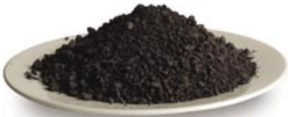
Figure 5 Steel Furnace Slag Asphalt Sand

State Environmental Agencies typically do not classify wastes into categories. The generator determines the classification according to developed Environmental Guidelines where they exist in each State. For example, the NSW EPA operate Environmental Guidelines allocating wastes into one of four categories (inert, solid, industrial, or hazardous) based on the nature and mobility of the chemical species they contain. Each category requires different material handling and management practices.