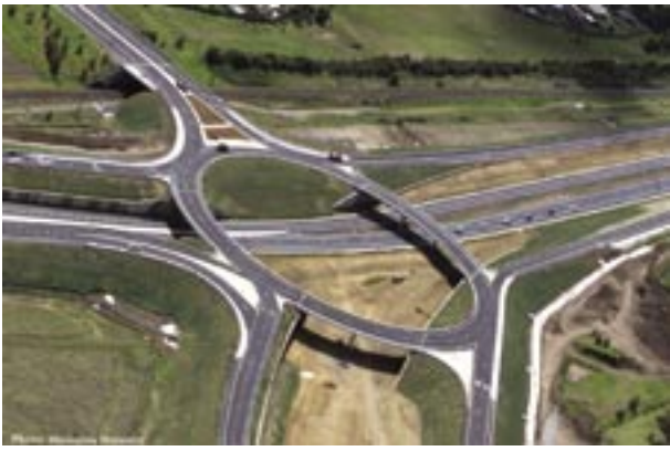
Figure 4 Steel Furnace Slag use in road construction