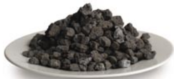
Figure 3 Steel Furnace Slag Aggregate

From the selection of the raw materials to produce the molten iron & selection of recycled steel (scrap) through to the finished aggregates or fine materials, slag products are controlled by a range of quality systems.